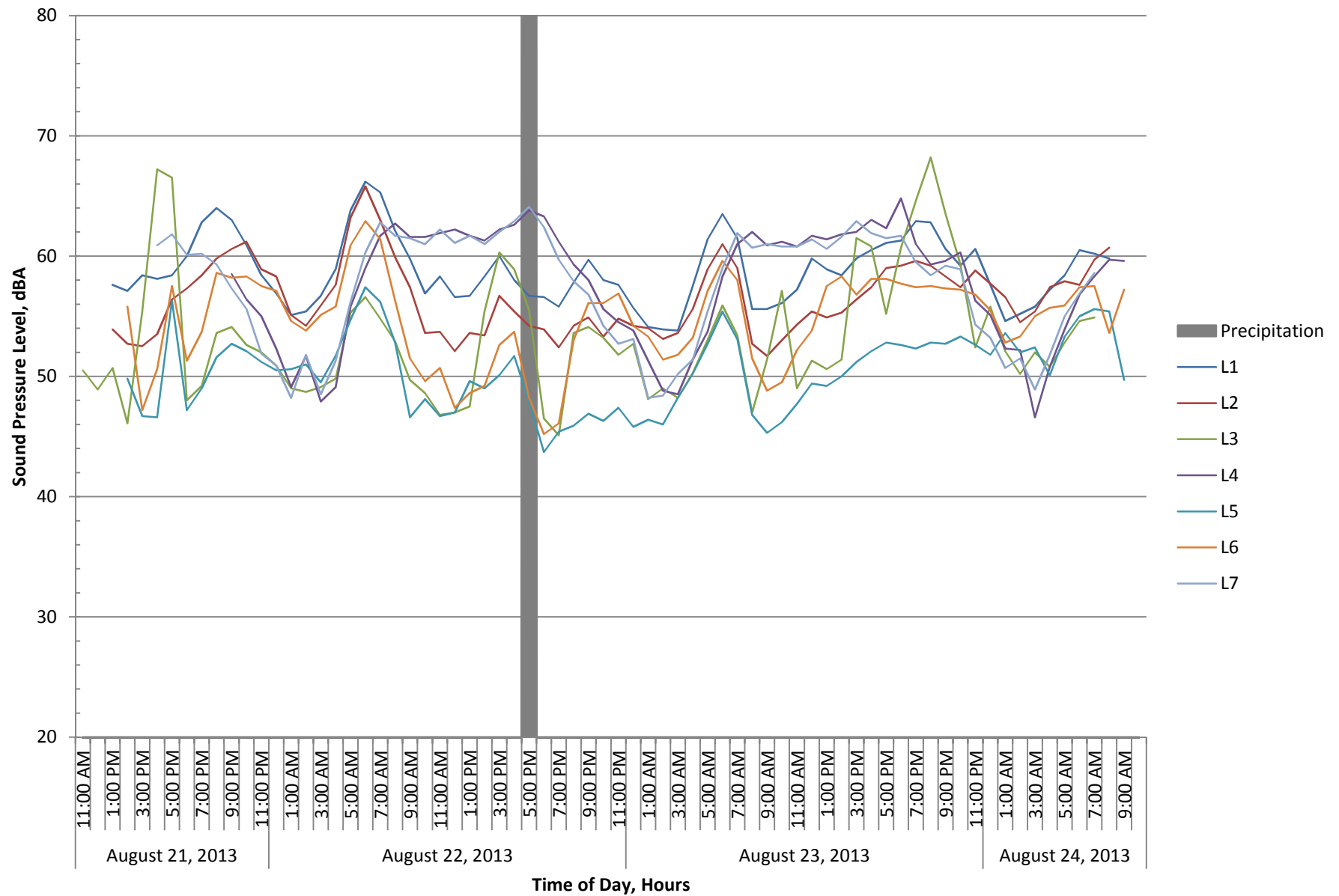
Figure A1: L_{eq} Ambient Sound Levels by Location